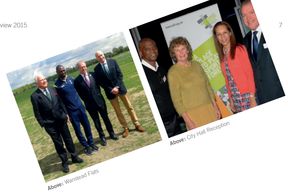
Above: Wanstead Flats