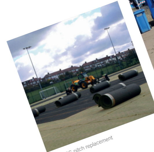
Above: 3G pitch replacement

At the 2014 Gala Dinner Clare Balding made an impassioned plea to get more girls playing sport with the pledges collected helping to fund Active Angels Too. This innovative project provides a range of gym and studio based activities at a community sports facility to visually impaired teenage girls with the intention of building their confidence and self-esteem so that they can start to develop a sporting habit for life. The reaction of the girls has been fantastic and, with their newly found confidence, they are having a great time.