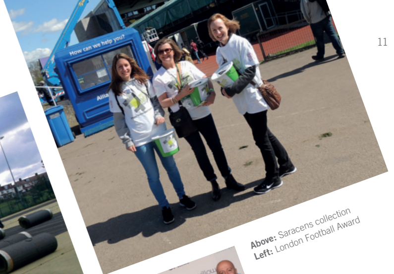
Above: Saracens collection Left: London Football Award