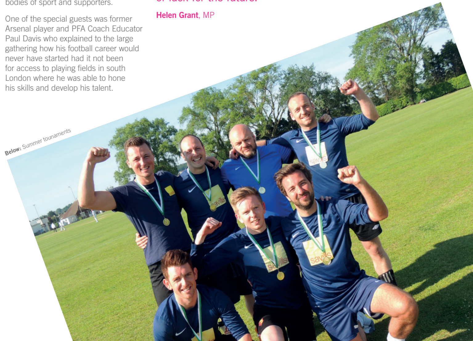
Below: Summer tournaments