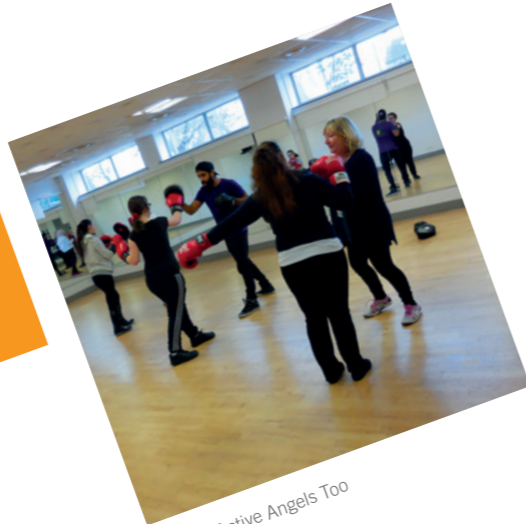
Above: Active Angels Too